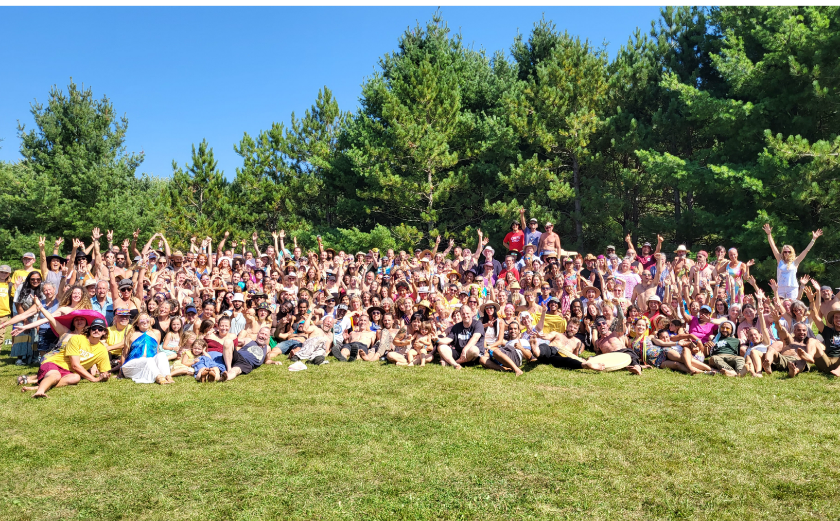
2023 Post Festival Photo